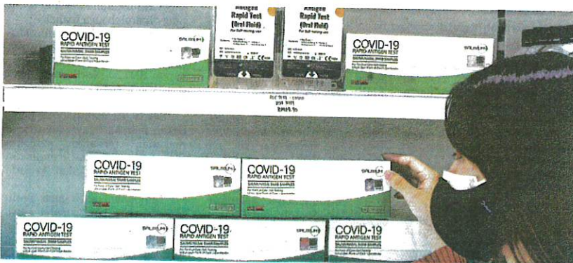
SEORANG pengguna mendapatkan kit ujian pantas antigen Covid-19 yang dijual pada harga RM19.90 seunit di sebuah farmasi di Presint 8, Putrajaya semalam. - FAISOL MUSTAFA

Semalam Kosmo! melaporkan, kes kematian masih melepasi angka 300 untuk tiga hari berturut-turut dengan 336 kes dilaporkan kelmarin, menjadikan jumlah keseluruhan kes kematian akibat Covid-19 sebanyak 18,219 kes.