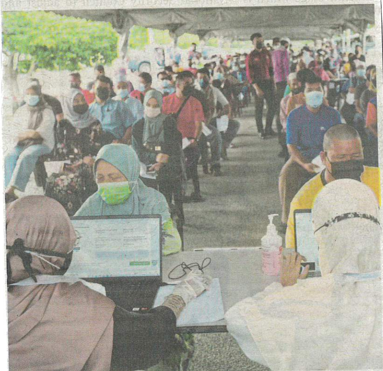
People waiting to get vaccinated against Covid-19 in Pengkalan Chepa, Kelantan, on Sunday.

He said Kelantan had more than 130,000 students aged between 12 and 17.