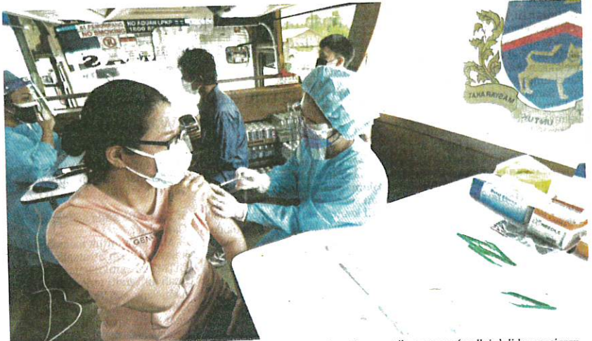
Penduduk Sungai Apong, Kuching dan kawasan sekitarnya mendapatkan suntikan secara 'walk in' di bas pesiaran yang diubah suai menjadi klinik mini.

Sementara itu, pada peringkat nasional, jumlah kes baharu COVID-19 semalam mencatat penur-