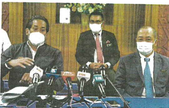
Health Minister Khairy Jamaluddin (left) and Sabah Chief Minister Datuk Seri Hajiji Noor at a press conference in Kota Kinabalu yesterday.

Khairy said the Health Ministry would also supply the state with additional medical equipment, comprising 480 oxygen cylinders, 24 boxes of oxygen regulators and five boxes of Covid-19 medication, which were scheduled to arrive today.