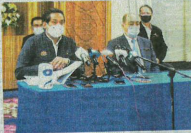
Khairy Jamaluddin (kiri) dan Ketua Menteri Sabah, Datuk Seri Hajiji Noor pada sidang akhbar selepas pengperutusan mesyuarat CITEF Peringkat Negeri Sabah di PPNS Kota Kinabalu pada Isnin.

Kementerian Kesihatan Malaysia (KKM) melaksanakan penempatan mobilisasi semula tenaga kerja bagi membantu menangani peningkatan kes Covid-19 di Sabah.