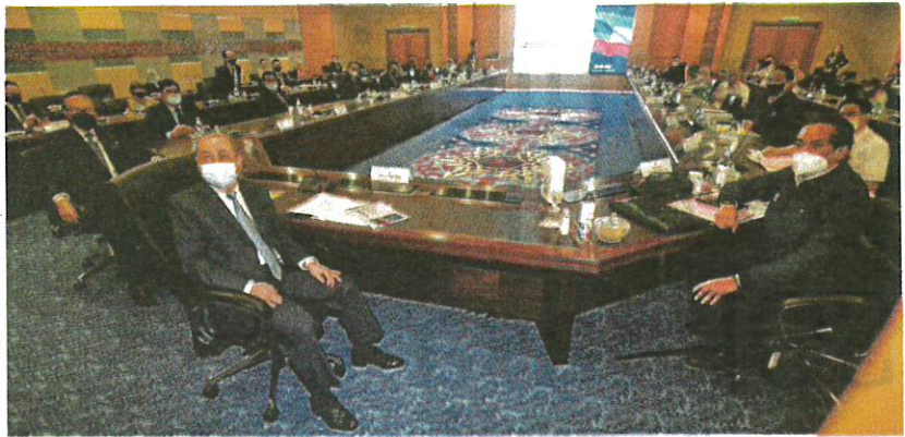
Hajiji (kiri) mempengerusikan mesyuarat bersama Badan Bertindak Imunisasi COVID-19 Kebangsaan Sabah yang turut dihadiri Khairy Jamaluddin di Kota Kinabalu, semalam.

"Jawatankuasa Pengurusan Bencana Negeri (JPBN) Sarawak dan Jabatan Pendidikan Negeri sedang meneliti perkara ini (kese-